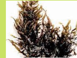
Limu huluhulu waena