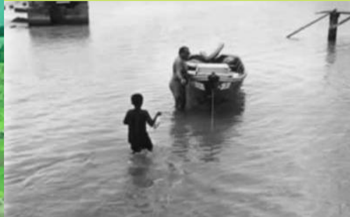
1975 Man and son anchor their fishing boat

Mokauea, an 'ili kū that contains a 13-acre island/islet located in the Kona region of O'ahu, sits within the waters of Ke'ehi Lagoon (the stream fed by the Moanalua, Kalihi, and Kapālama streams), which is off the coast of Mauiola (a.k.a Sand Island). This island was seen as a fishing village because it would sustain the fishermen and their 'Ohana.