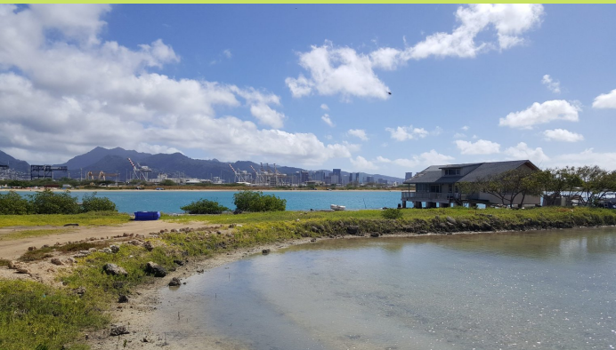
Loko I'a located at Mokauea (Native Science report)

The sea for small crabs is at Lelewi , The sea of many harbors is at Puuloa , The sea that blows up nehu & lala , Is the sea of Ewa , so calm The Great Ewa of La'akona