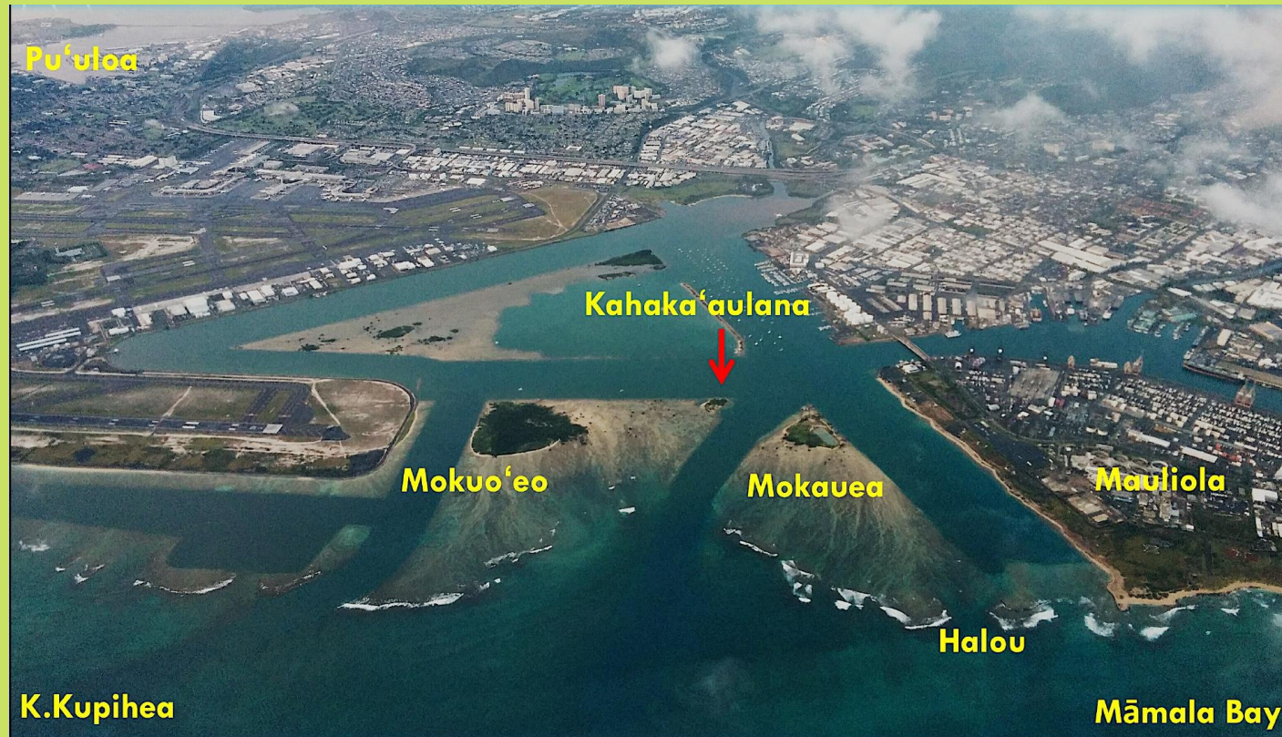
Figure 21. Map from Ho'ōla Ke'ehi organization showing the inoa 'āina (Kona Wahi Hoola Inventory)