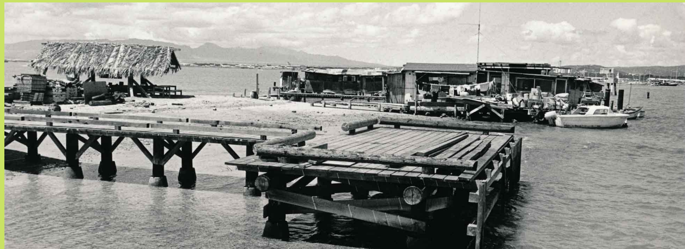
1980 Landing dock on Mokauea island with Romo's house and canoe hale in the background. (Ed Greevy)